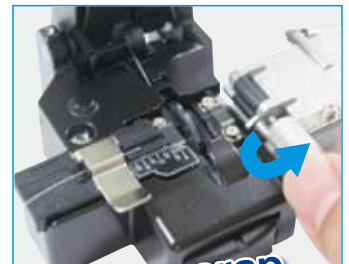
Fiber scrap collection