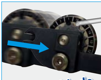
Circular blade sliding

Suitable for FTTH Dedicated for single fiber cleaving. Outstanding cost performance.