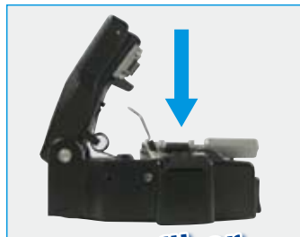
Easy fiber placing