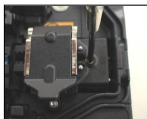
Setting onto splicer

Note) The CLAMP-S60 series is supplied with a pair, for the left and the right respectively.