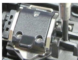
How to set

Note: CLAMP-S70 series is supplied as a pair, for the left and the right respectively.