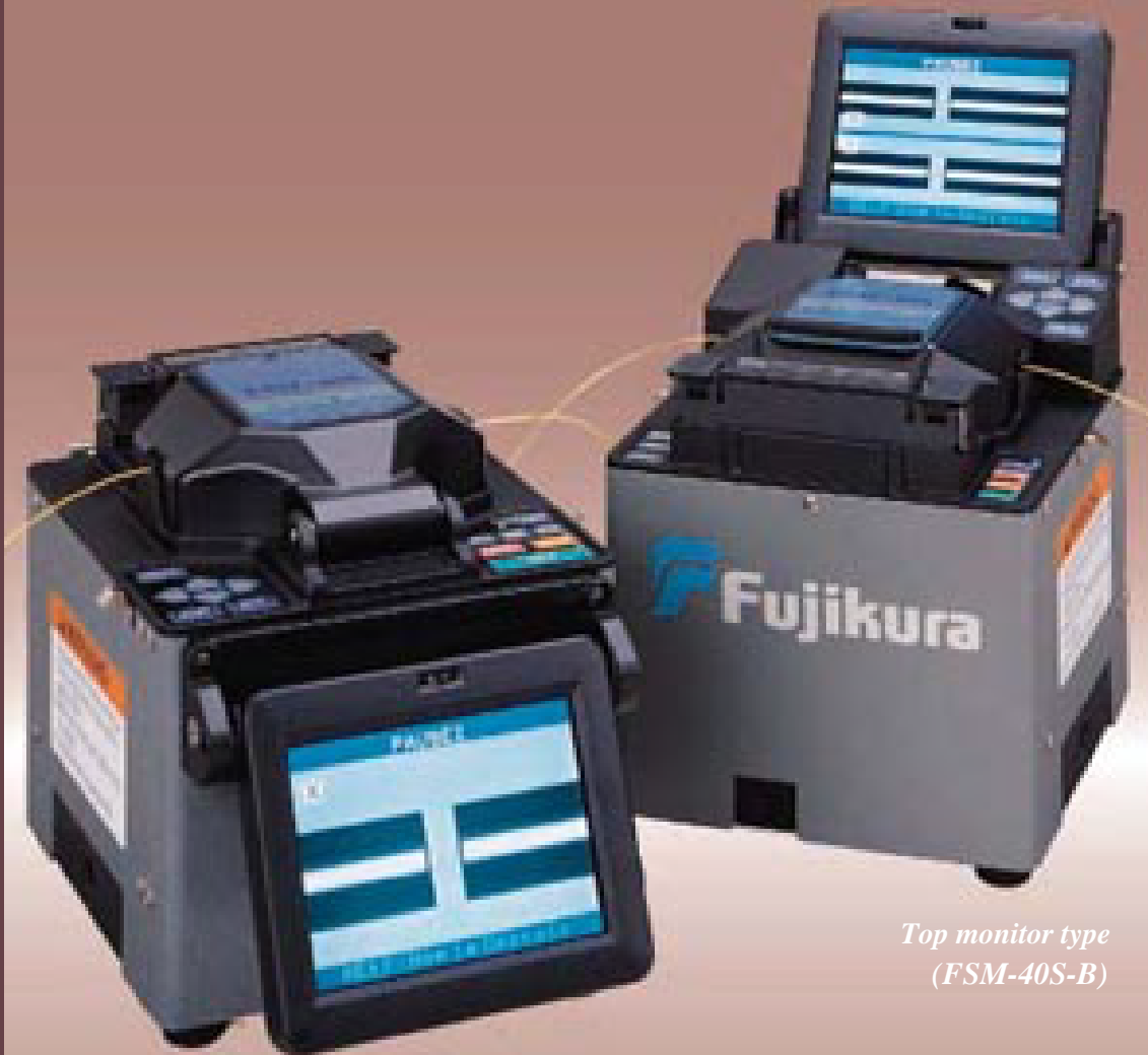
Front monitor type (FSM-40S)