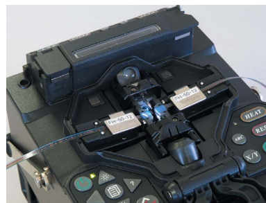
Top view of FSM-50R12