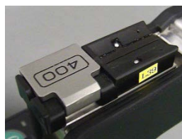
With the holder of FH-40 and FH-100series