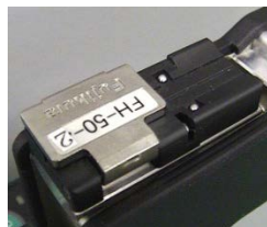
With the holder of FH-50 and 60 series

The USC-02 is Ultrasonic Cleaner designed for the cleaning of optical fiber using the FH-40, 50, 60 and 100 series of Fujikura Fiber Holder. By using this equipment the fiber can be cleaned after stripping without any physical contact.