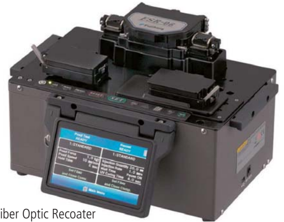
FSR-06 Fiber Optic Recoater with 2N proof tester