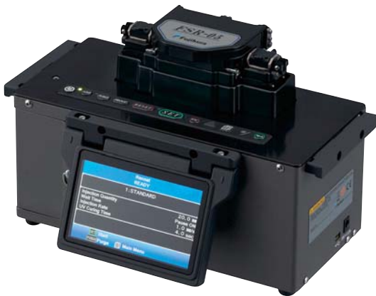
FSR-05 Fiber Optic Recoater

Purchase a FSR - 05, 06, or 07 between January 1 - December 31, 2018