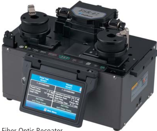
FSR-07 Fiber Optic Recoater with 10N proof tester