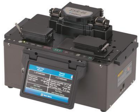
FSR-06 Fiber Optic Recoater with 2N proof tester