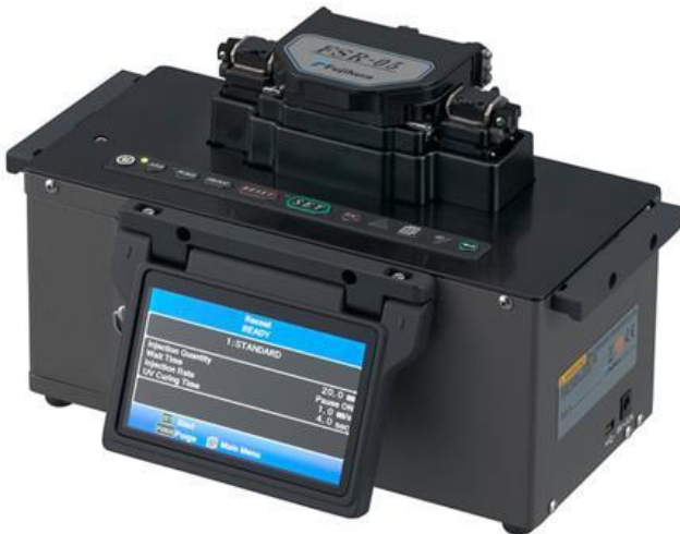
FSR-05 Fiber Optic Recoater

Purchase a FSR-05/FSR-06/FSR-07 between January 1, 2018 - June 30, 2019