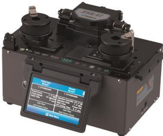
FSR-07 Fiber Optic Recoater with 10N proof tester