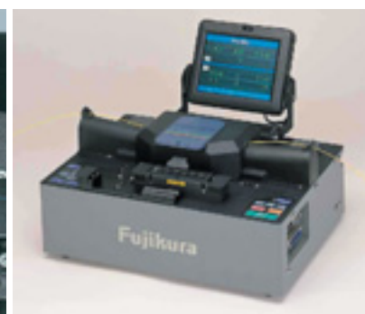
Fujikura Fusion Splicer